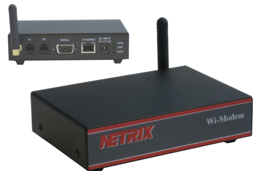
3G Wi-Modem unit shown 4G available.